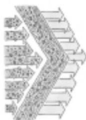
FIGURE 2 PROTECH™ FILTERS