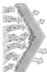
FIGURE 1 MOST MEDIA FILTERS

Most common media filters (Figure 1) restrict airflow throughout the heating and cooling system, causing higher energy costs. This surface accumulation of airborne particles restricts airflow and makes the entire heating/cooling system work harder. Protech™ filters (Figure 2) capture and retain pollutants inside the filter, allowing air to flow freely through the system, increasing efficiency and reducing heating and cooling costs.